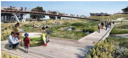
Boardwalk/Trail (Bike and Pedestrian)