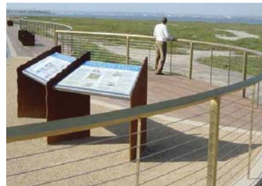
Interpretive Nature Overlook