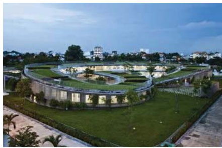
La Rinconada Restaurant