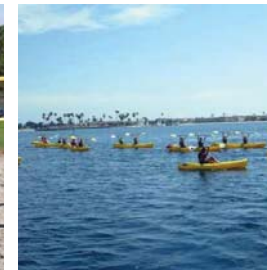
Non-Motorized Boat Rentals