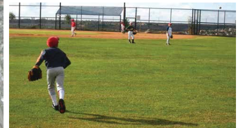
Ball/Sports Field With Lighting