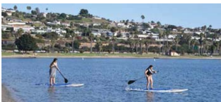
Non-Motorized Boat Rentals