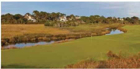
Golf Course With Barranca