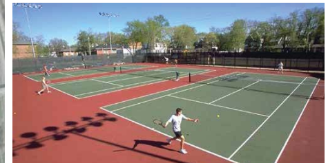
Tennis With Lighting