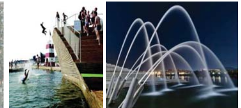
Iconic Swim Platform with Large Salt Water Fountain