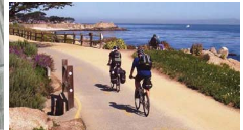
Boardwalk/Trail (Bike and Pedestrian)