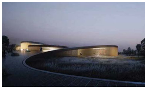
La Rinconada Restaurant