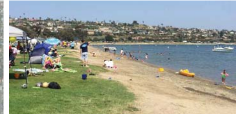
Expanded Beach Wrapping Cove